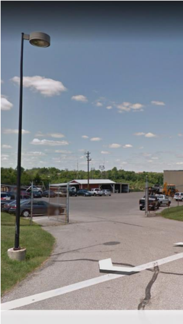
19. Location 21- Operations & Maint Loading Dock (add extra head)