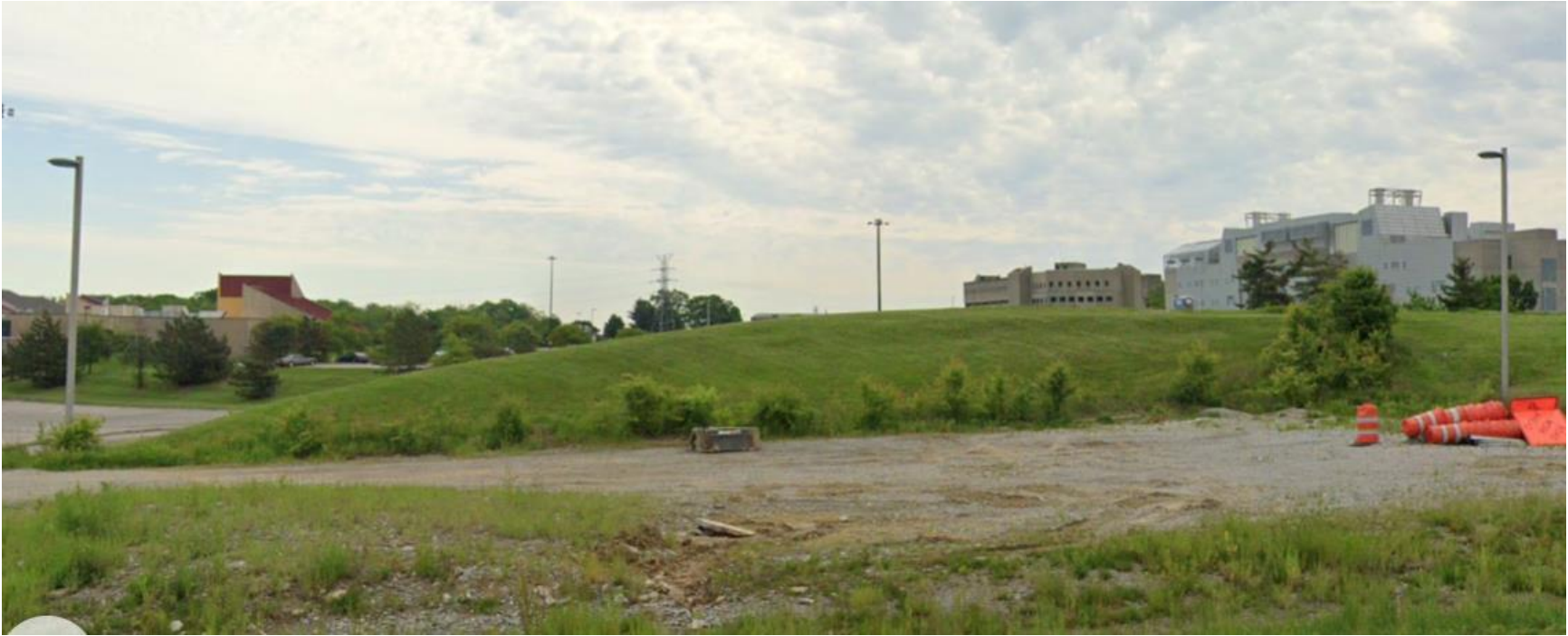
25. Location 27- Lot L- Parking Lot (1 head to 4 heads)