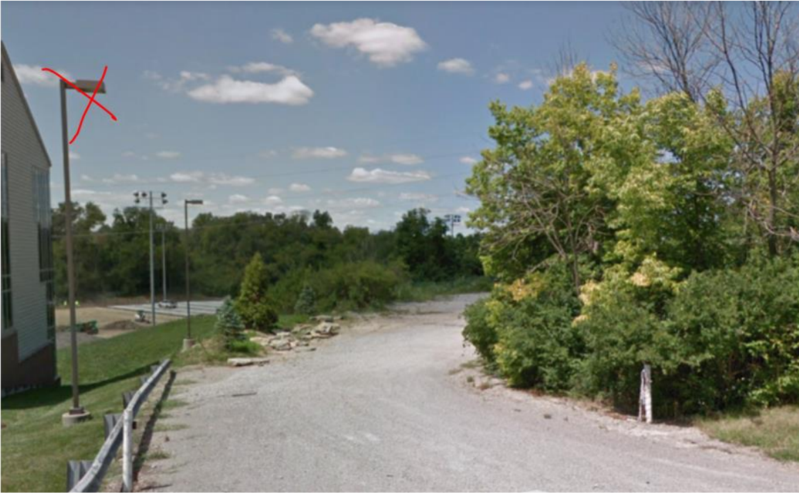
18. Location 20- Operations & Maint Loading Dock