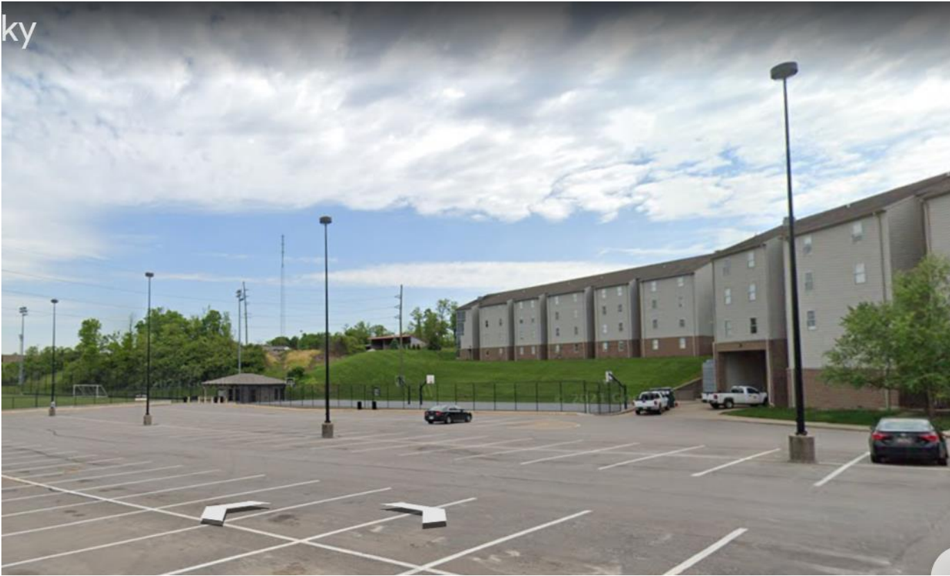
13. Location 14 – University Suites Courtyard