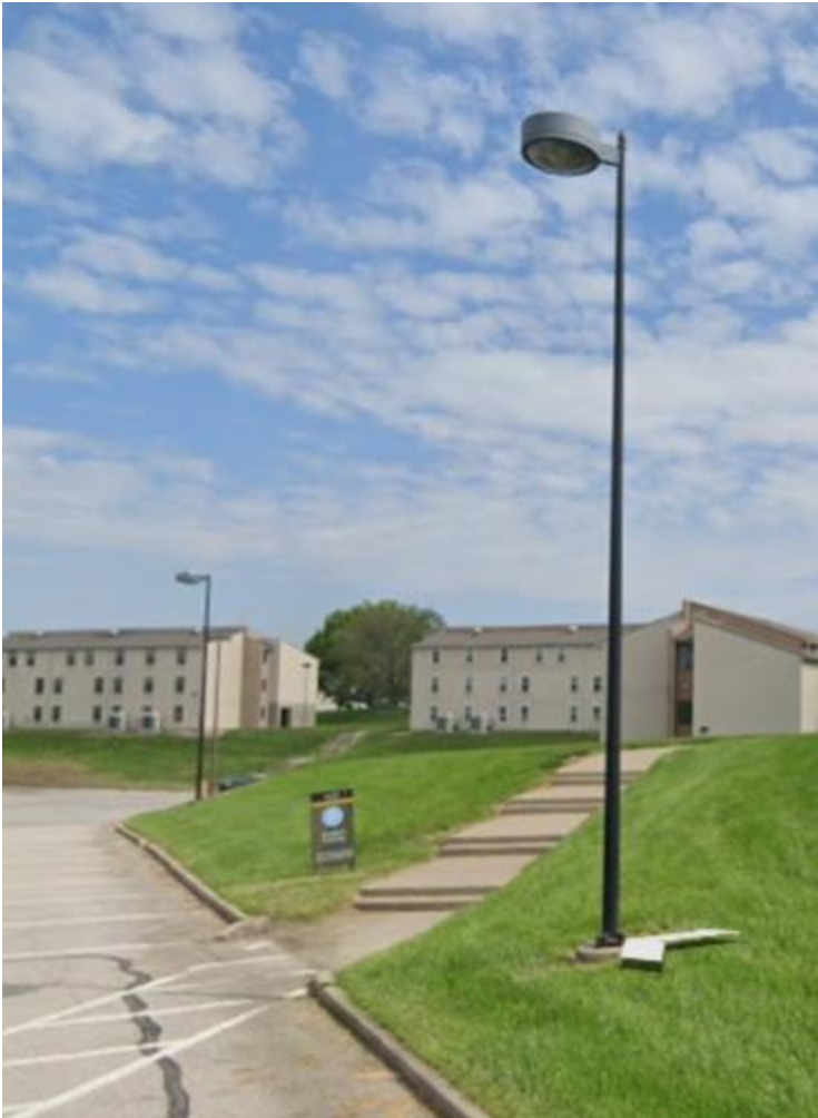
23. Location 26- Lot Y- Parking Lot (Disconnect & Remove)