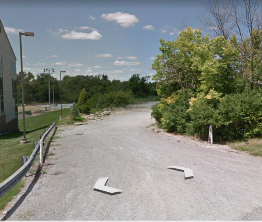
17. Location 20- Operations & Maint Loading Dock