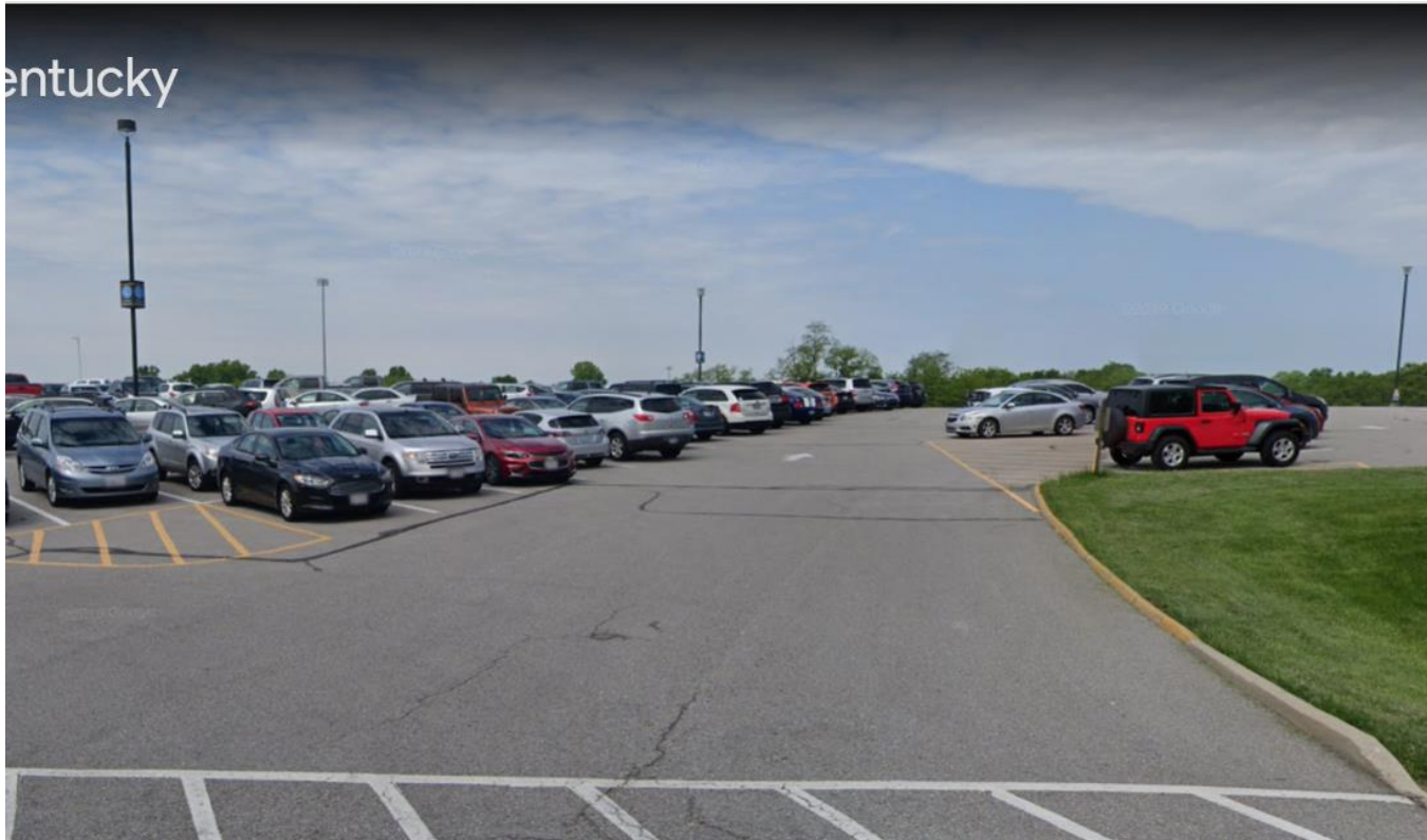
25. Location 28- Campbell Hall Drive