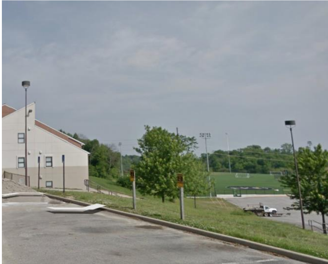
11. Location 13 – University Suites main Parking Lot- Q