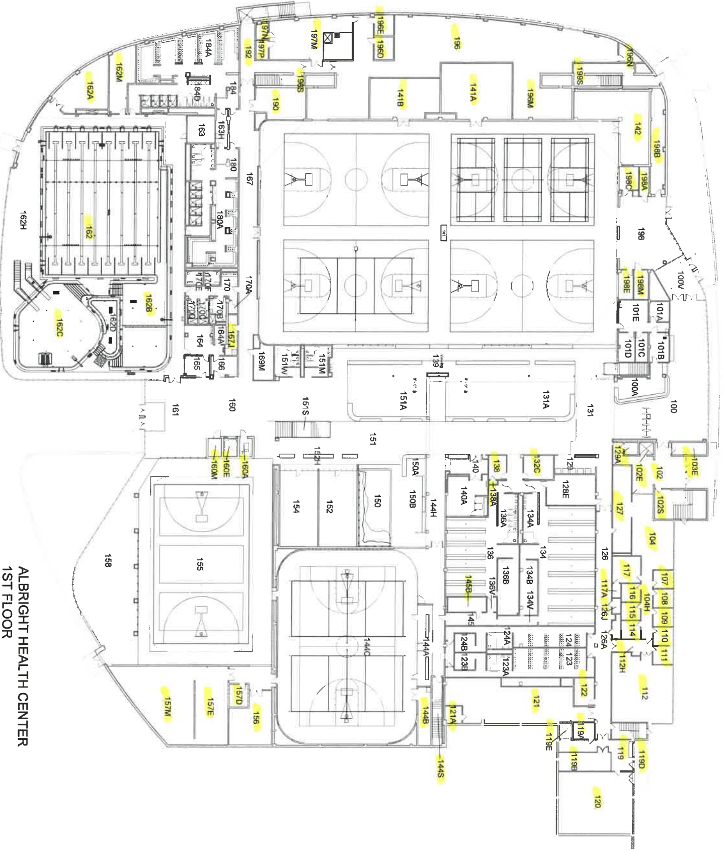
ALBRIGHT HEALTH CENTER 1ST FLOOR